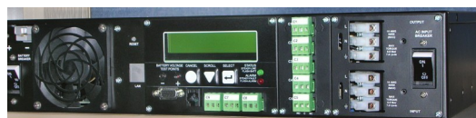
Alpha Novus FXM 650

1760 Monrovia Avenue, Suite C8 Costa Mesa, Ca USA 92627 www.sbcdatapower.com Phone 949 646 9191 Fax 949 258 5288