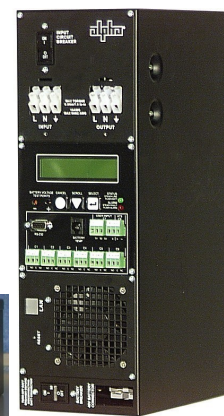
Alpha Novus FXM 1100 & 2000

The power connection panel and the control panel can be rotated for ease of connection and use in any mounting position.